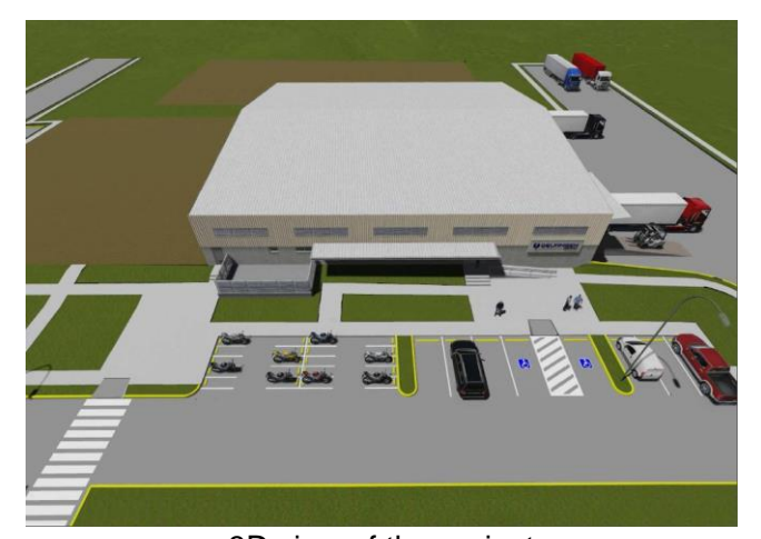
3D view of the project